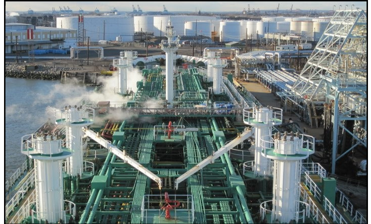
S/S Chemical Pioneer