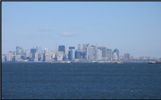
New York Harbor