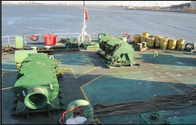
Stern of the S/S Chemical Pioneer