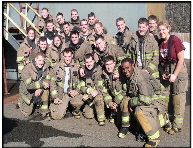
Twenty-two of Kings Point's finest!